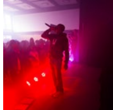
Click to view: Levi's Music Vince Staples