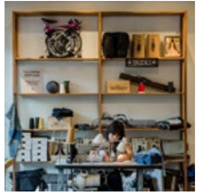
Click to view: Levi's Communter Now for Women