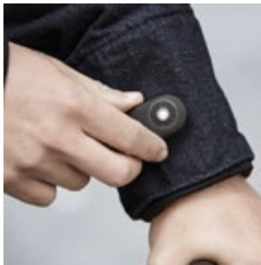
Click to view: Levi's Communter Jacquard